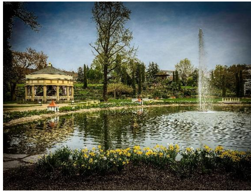
“Ludwigsburg,” by Mile Davis First Place, Beginner Color, 2023 River Pointe Annual Exhibit